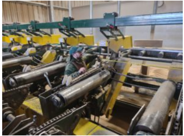
Remmey - The Pallet Co.

Since 1988, the Innovative Manufacturers' Center (IMC) has helped nearly 700 hundred Central Pennsylvania manufacturers become more profitable and competitive by tapping into valuable local, regional, and national resources.