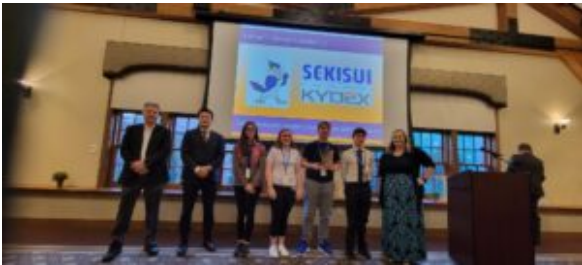
Viewers Choice Award Winner - Central Columbia Middle School and SEKISUI KYDEX