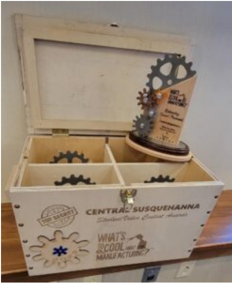
2023 Central Susquehanna Awards