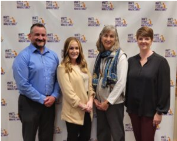
Central Susquehanna WSCM