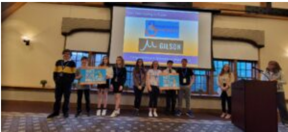
Congratulations to Selinsgrove Area Middle school and Central Columbia Middle School on being selected to move on to the statewide competition in Harrisburg next month. Good luck!