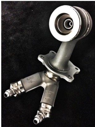
Figure 2: GE LEAP Engine Nozzle produced by the powder bed fusion process.

Additive manufacturing can provide many significant advantages over traditional processes: design is no longer limited by traditional machining constraints, fine-tuned customization can be implemented on small production lots, and components which previously had to be constructed from multiple parts may be consolidated—just to name a few. Hence, AM is a highly flexible process that enables a company to be highly responsive to market needs at minimal cost. Because of these benefits, large companies having broad product and manufacturing sectors, such as GE, are rapidly developing and adopting AM for select components. An example is the GE LEAP Engine Nozzle, built entirely using AM with the powder bed fusion process. The LEAP nozzle, shown to the left, incorporates design feature that improves performance, significantly decreases manufacturing steps and cost, and extends the useful life of nozzle.