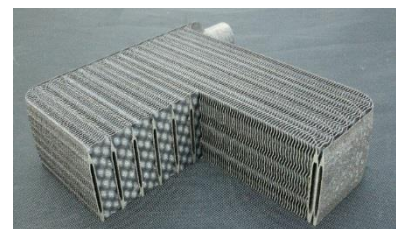
Figure 3: Heat Exchanger designed and built at CIMP-3D at Penn State using the powder bed fusion process and sliced to show internal structure.

As a disruptive technology, AM may play an important role in expanding markets and developing new products, which should include SMEs. Over 90 percent of manufacturing firms within the United States represent small businesses, and SMEs hold more patents than large organizations. They tend to be agile and responsive to market demands, are very knowledgeable of customer requirements, and also form a strong second and third tier supply chain for larger organizations. Although these attributes make AM a natural fit for SMEs, in most instances smaller organizations lack the vast technical resources of huge companies and this can hinder implementation of new technology. Hence, the SME Challenge is intended to identify opportunities and practices that may be used to encourage adoption and exploitation of AM technology for small businesses, and to provide resources to SMEs for determining the viability of their concepts.