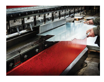
Forming, Fabricating, Stamping